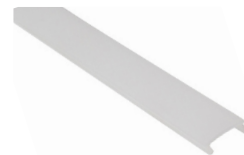
Opal matte cover