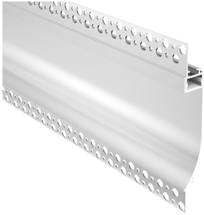
Model | LB54086 / LB54088