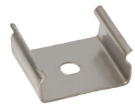
Mounting clips (metal)