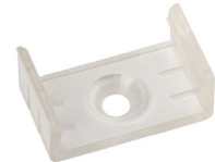
Mounting clips (pc)